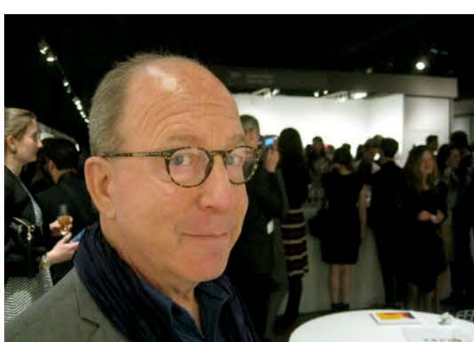
Jerry Saltz, art critic for New York Magazine.